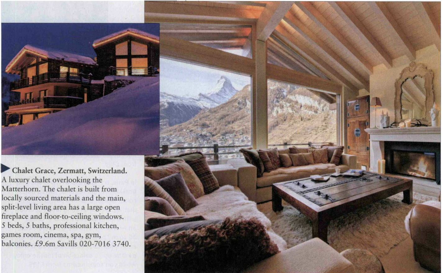
► Chalet Grace, Zermatt, Switzerland. A luxury chalet overlooking the Matterhorn. The chalet is built from locally sourced materials and the main, split-level living area has a large open fireplace and floor-to-ceiling windows. 5 beds, 5 baths, professional kitchen, games room, cinema, spa, gym, balconies. £9.6m Savills 020-7016 3740.